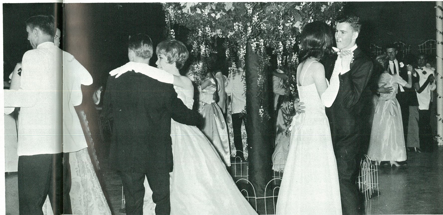
Couples dance in the atmosphere of an old southern plantation during the annual event.